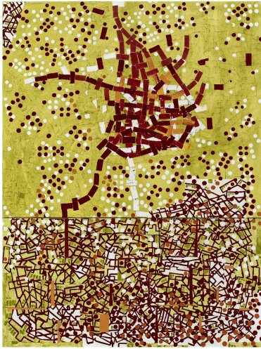
Rick Lowe, Untitled , 2021. Acrylic paint and paper collage on canvas, 96 x 72 in. (whole component). © Rick Lowe, courtesy the artist. Linda Pace Foundation Collection, Ruby City, San Antonio, Texas.