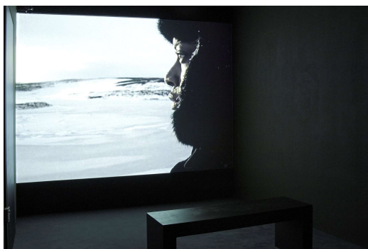
Isaac Julien, True North , 2005. Single-screen projection, 16mm film transferred to DVD, black and white/color, sound. Duration 14 minutes 20 seconds. Edition AP/10. Linda Pace Foundation Collection, Ruby City, San Antonio, Texas

Opening Reception: March 19, 2022, 2–6pm